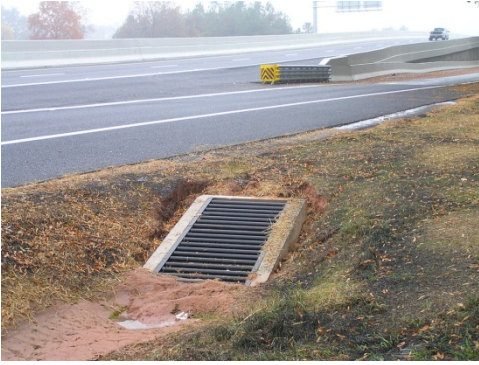
EXHIBIT 5 – SPECIAL PROVISIONS AND CONTRACT REQUIREMENTS

Use Pipe End Structure (719-615-00) when specified in the plans or special provisions. Use pipe end structure in locations where pipe exposed end faces the direction of traffic. Pipe end structures may be used in other locations if approved by the RCE.