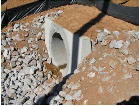
EXHIBIT 5 – SPECIAL PROVISIONS AND CONTRACT REQUIREMENTS

Use Pipe Straight Headwall (719-605-00) when specified in the plans or special provisions. Use straight headwall only in locations where pipe exposed end does not face the direction of traffic.