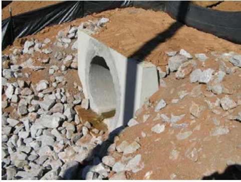
EXHIBIT 5 – SPECIAL PROVISIONS AND CONTRACT REQUIREMENTS

Use Pipe Straight Headwall (719-605-00) when specified in the plans or special provisions. Use straight headwall only in locations where pipe exposed end does not face the direction of traffic.