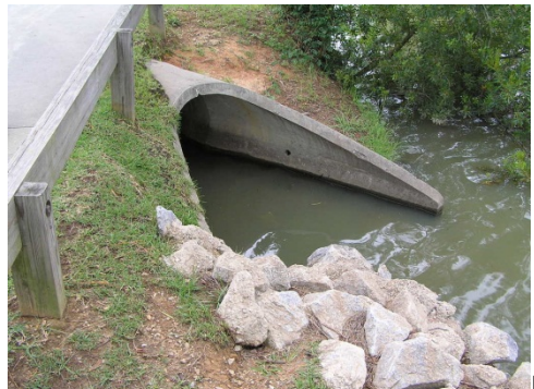
plans or special provisions.

Use Pipe Flared End Section when specified in the