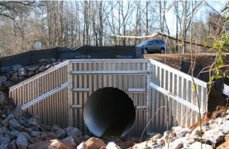
Use Pipe Wingwall