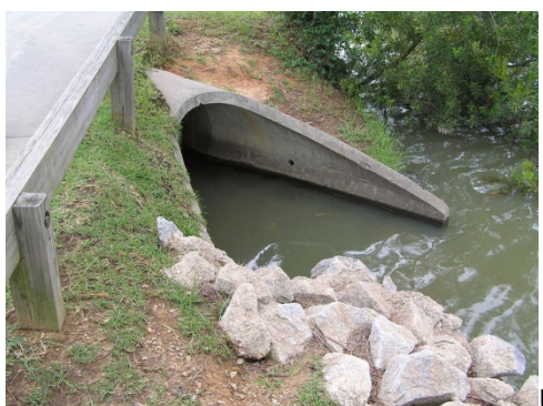
Use Pipe Flared End Section when specified in the plans or special provisions.