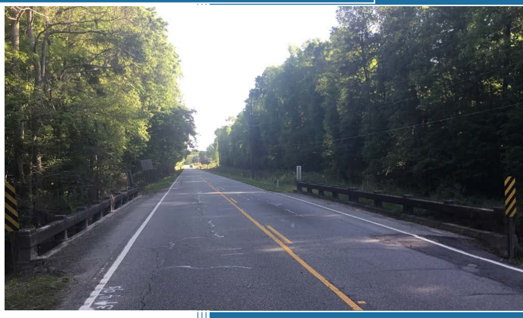
US 15 over Indian Field Swamp