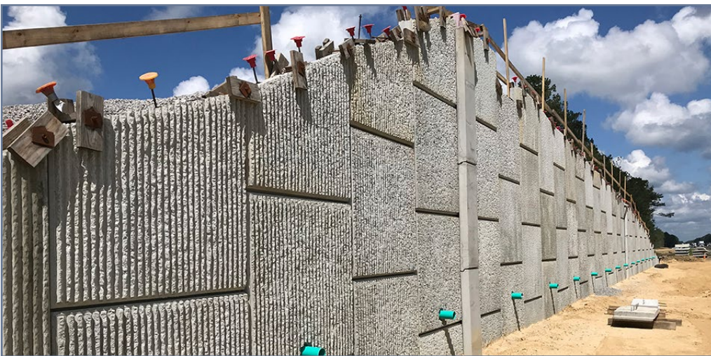
Left Image: MSE wall installation in progress.