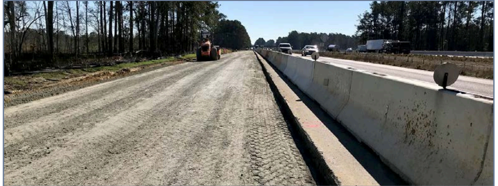
Crew places stone in exit lanes in preparation for paving.

The SCDOT is constructing a new three-leg directional interchange along I-26 in Berkeley County, South Carolina. The interchange will provide access from I-26 to the new Volvo Car Drive which leads to Camp Hall Commerce Park and the Volvo facility. The new interchange will be located along I-26 at approximate mile marker 189 which is approximately two (2) miles east of SC 27/Ridgeville Road (exit 187) and approximately five (5) miles west of Jedburg Road (exit 194). The proposed interchange includes both at-grade and flyover ramps.