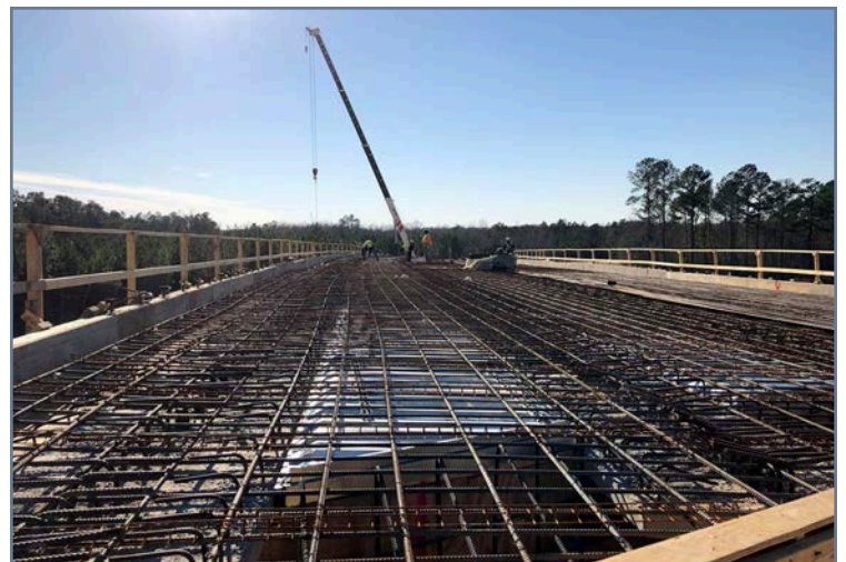
Installation of steel reinforcement for the concrete decks.